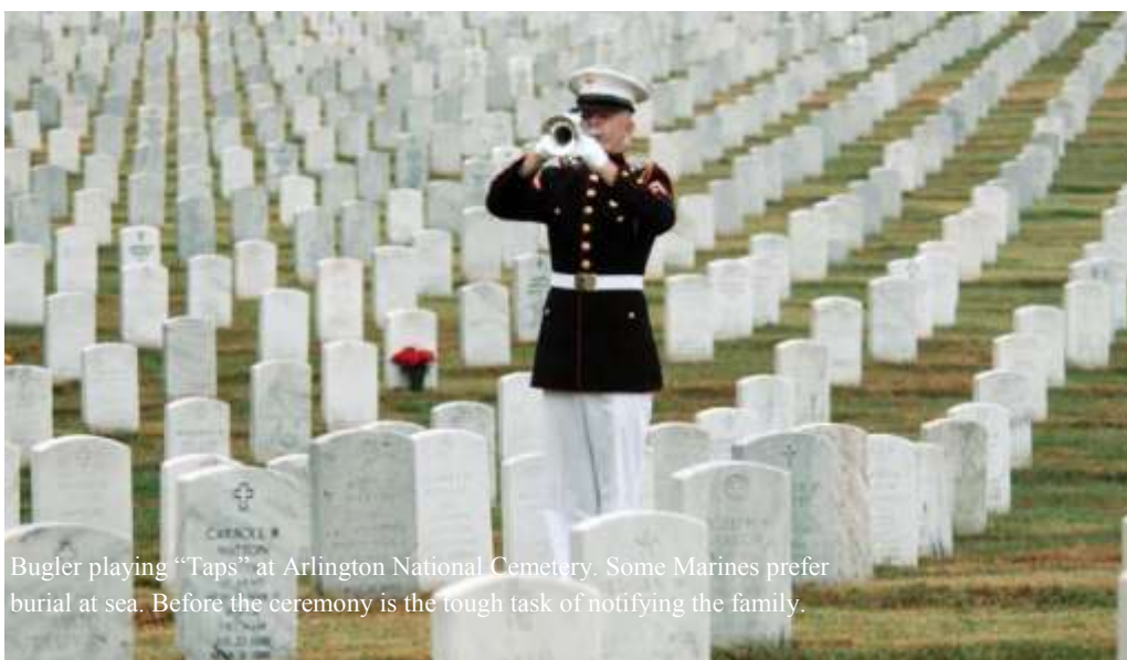
Bugler playing “Taps” at Arlington National Cemetery. Some Marines prefer burial at sea. Before the ceremony is the tough task of notifying the family.