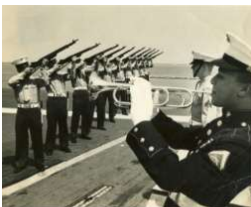
Rehearsal for Burial at Sea. Docked in Norfolk, summer 1965

The father looked at me once and shook his head sadly.